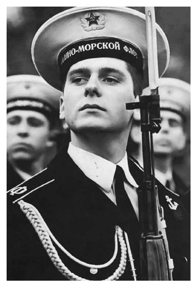
Honor Guard of Soviet Navy

"...Soviet naval deployments would eventually cover all areas of the globe—including the Caribbean. The Cold War at sea entered a new era."