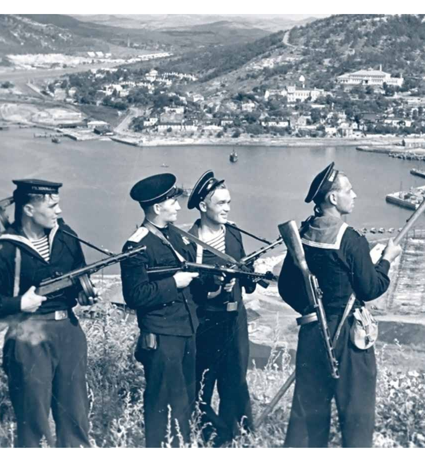
Pacific Fleet Marines of the Soviet Navy hoisting the Soviet Naval ensign in Port Arthur, 1 October 1945