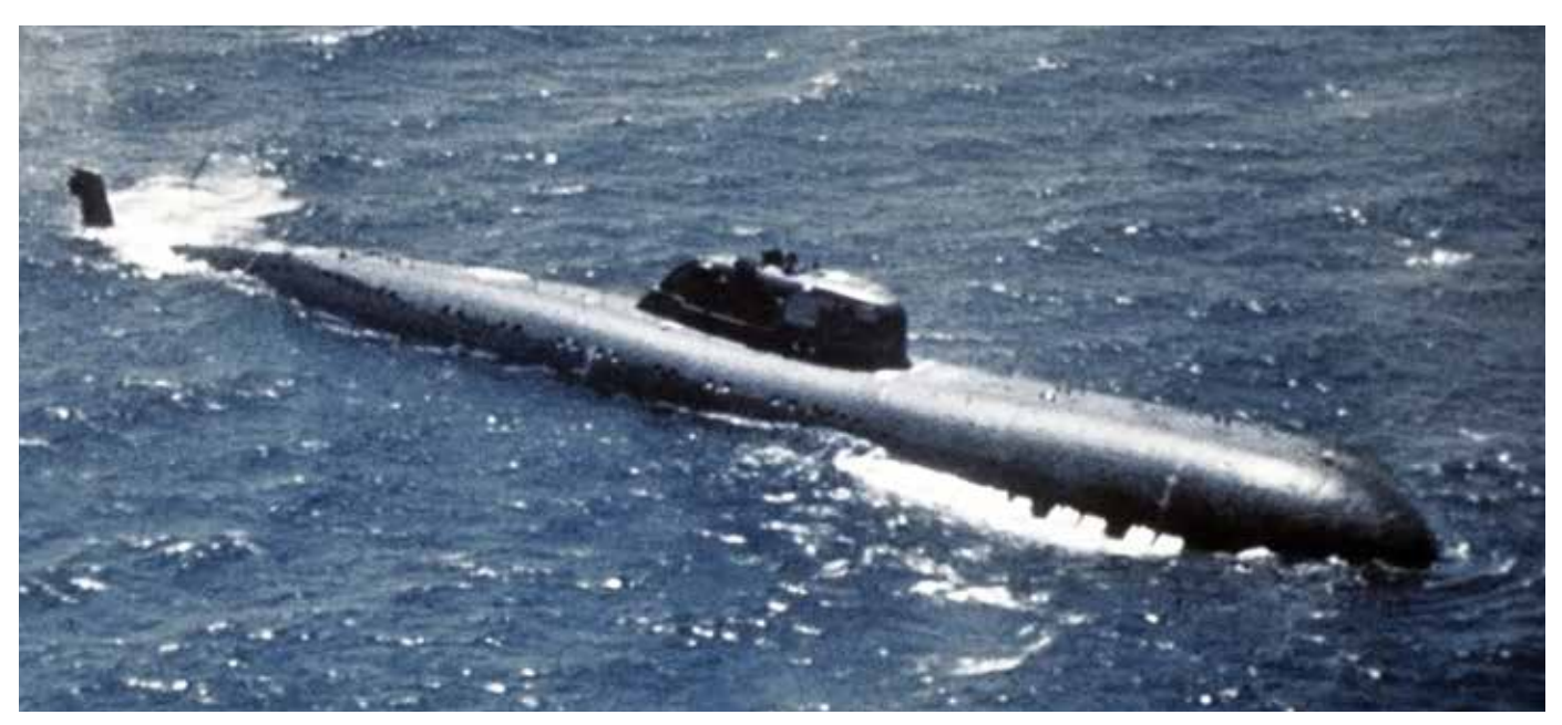
An aerial starboard beam view of a Soviet Charlie I class nuclear-powered submarine underway

War only reinforced Stalin's conviction that the USSR needed a large ocean-going navy. The Soviet leader pushed forward a large construction program that began producing cruisers and fast destroyers at about the time of his death in 1953.<sup>3</sup>