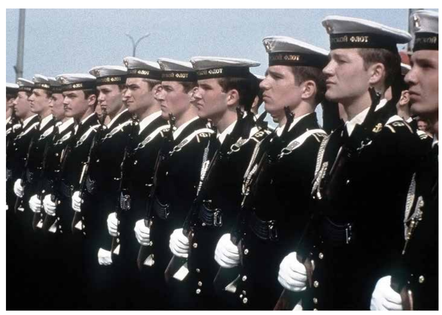
Soviet Navy Personnel—1982

range of Soviet targets. Gorshkov's vision of the Soviet Navy was still years in the future but signs were already appearing in the USSR naval-shipbuilding industry. The Soviets continued to produce long-range missile-carrying bombers and anti-submarine warfare aircraft, nuclear submarines, and had a broad array of major surface combatants under construction, including the Kiev-class aircraft carriers.