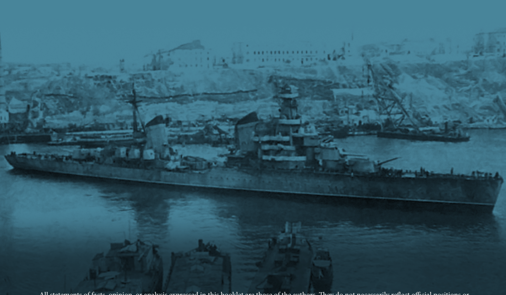
All statements of facts, opinion, or analysis expressed in this booklet are those of the authors. They do not necessarily reflect official positions or views of the Central Intelligence Agency or any other U.S. Government entity, past or present. Nothing in the contents should be construed as asserting or implying U.S. Government endorsement of an article's statements or interpretations.

collection reflect the tensions in the bipolar Cold War and specifically focus on the Soviet Navy's development of its naval forces during that timeframe. After World War II, U.S. leaders faced a nuclear armed rival and in no time, Soviet tanks were in the streets of Budapest, and the first Sputnik satellite was launched. Understanding how the Soviet Union envisioned the next combat situation required in depth knowledge of both their high level theory of warfare and probable tactical behavior. The collection will provide new insight into the Agency's analysis of the evolving Soviet Navy and its military posture during the Cold War.