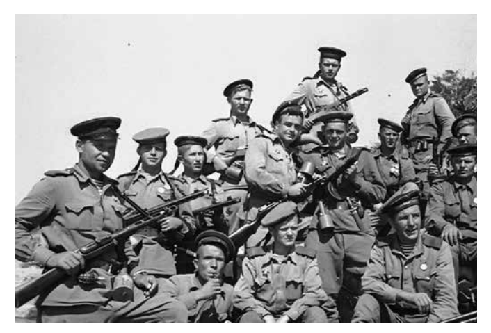
Soviet Naval Infantry

"All of the proposed reductions were meant to serve several purposes: to shift funds to the production of missiles and long-range bombers; to lessen the burden of military force requirements on heavy industry; to free labor for productive purposes in the civilian economy; and to bring international pressure on the United States to reduce its forces."