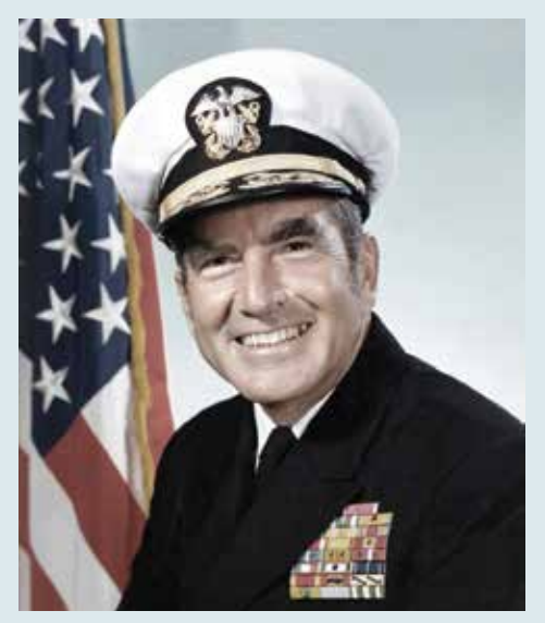
Admiral Elmo Zumwalt