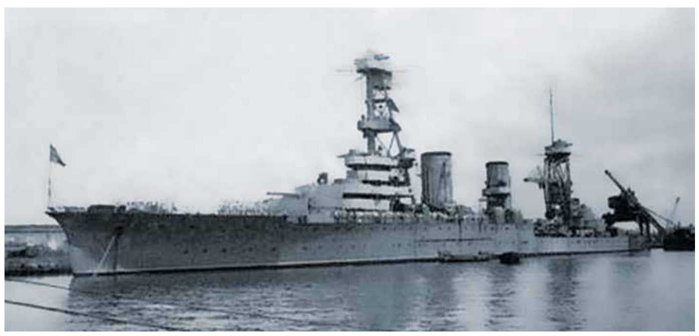
Soviet battleships—fighting U-boats in the Baltic Sea, WWII

The CIA intelligence reports, produced by the Directorate of Operations (DO)<sup>3</sup> made a significant contribution to understanding the history, plans and intentions of the Soviet Navy. Many of these documents are being released for the first time. These intelligence reports, however, do not represent the complete record—much information essential in the estimative process was from émigrés and defectors, as well as from the U.S. Navy, and imagery and signals intelligence, which are not specifically highlighted in this collection.