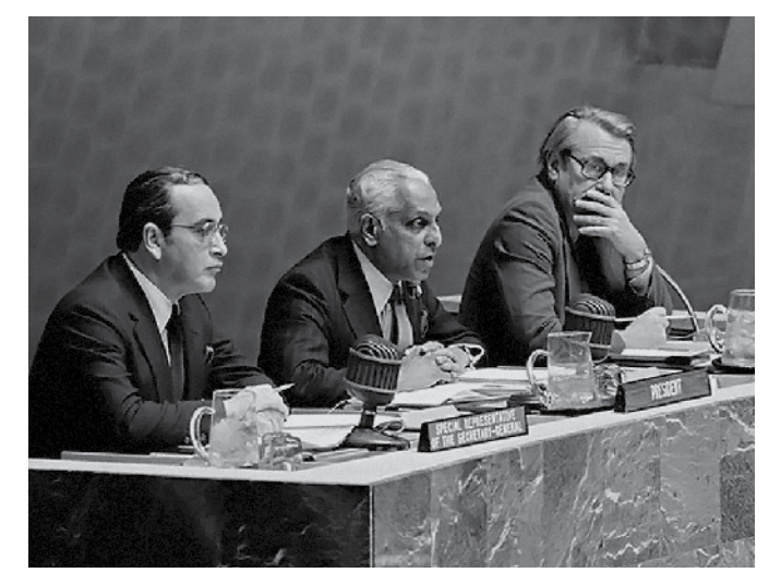
United Nations Convention on the Law of the Sea, 1980

NIE 11-15-82 and NIE 11-15-85, Soviet Naval Strategy and Programs through the 1990s, contain sections about distant naval operations short of war with the main naval powers. The major changes in Soviet posture followed construction of ships better suited to the mission. The estimates judged the Soviet use of naval diplomacy and power projection would increase during the 1980s and 1990s.<sup>20</sup> The 1980 Soviet Law of the Sea treaty negotiating instructions show the Soviets had changed their attitude about naval use of world oceans in two decades from one seeking to restrict Western naval access to one of virtually unconstrained transit of naval ships and aircraft.<sup>21</sup>